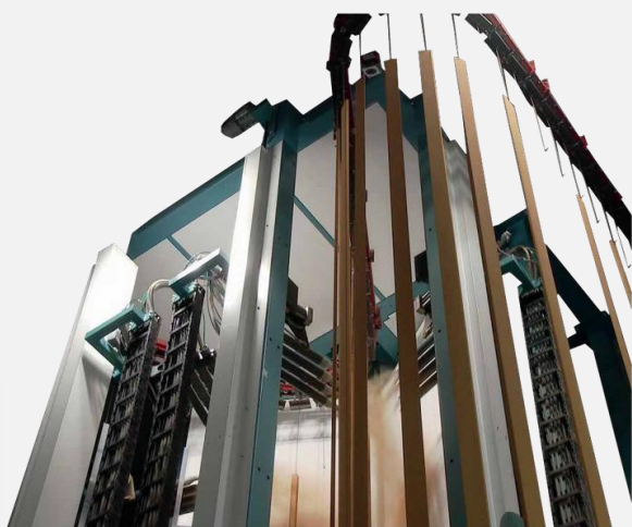
MS FCV (Fast Color Change / Open Booth) High-Speed Color Change Powder Coating System