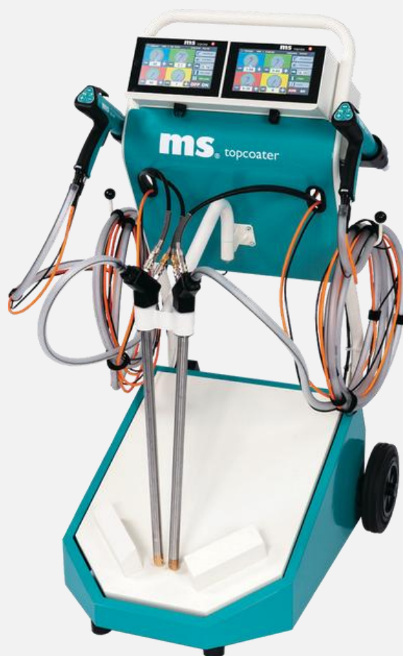
Topcoater Speedy Dual Gun Type