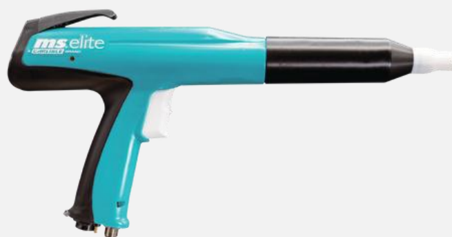
M5 Powder Hand Gun