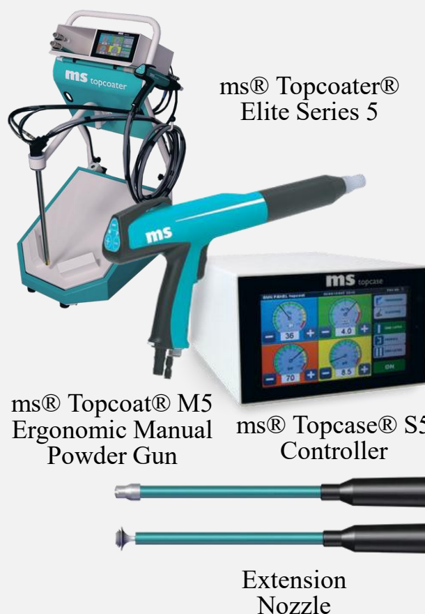
ms® Topcoat® M5 Ergonomic Manual Powder Gun