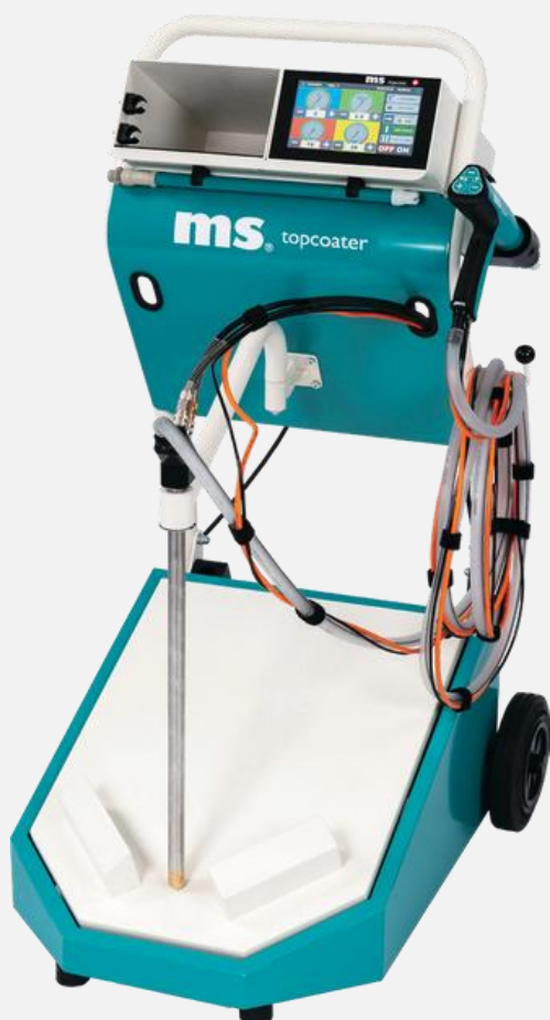
Topcoater Speedy Single Gun Type